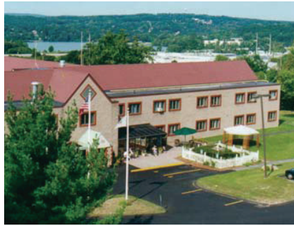
The Independent Order of Odd Fellows is proud to sponsor many Housing Projects throughout North America.